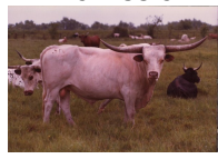
Y O LINDA